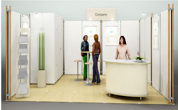
Illustration of a stand (20 m 2 ) with 2 more decoration elements (not included in the hire price per m 2 )

Construction + Service: Fax: +49(0)30/3067-2018 Mailing address: MB Capital Services GmbH, Standbau + Service, Thüringer Allee 12/12A, 14052 Berlin, Germany For queries: Phone: +49(0)30/3067-2015; E-Mail: info@mb-capital-services.de