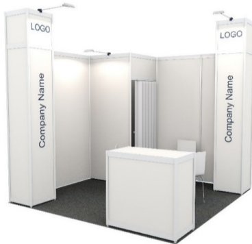
9 m 2 Example