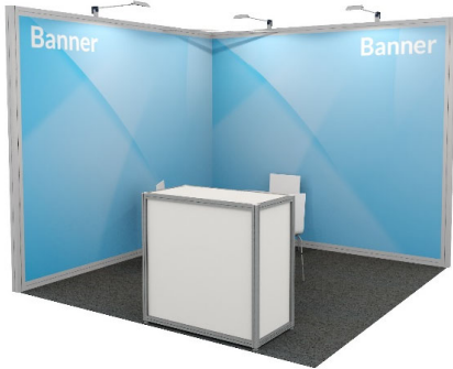
9 m 2 Example